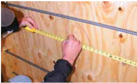
1. Using a tape measure, pull measurements from the horizontal and vertical positions to locate the center of the Infinity® wall sleeve.