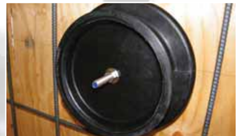
3. Slide second locator cap through (threaded rod*), use fender washer and fasten nut until locator caps and sleeve are locked in place. Check to make sure sleeve is square to form.