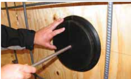
1. Extend (threaded rod*) through form and first locator cap and (threaded nut*) on the back side of form.