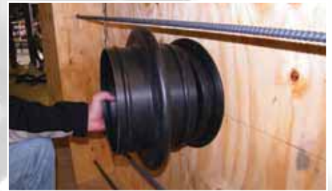
3. Cut the Infinity® wall sleeve \frac{3}{4} " shorter than the wall thickness (+/-1/4"), then insert the sleeve over the locator cap.