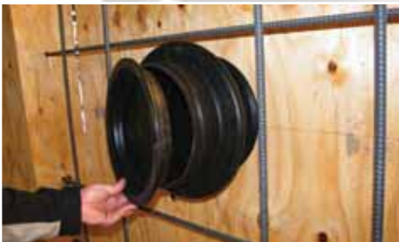
4. Insert the second locator cap.