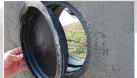
6. After concrete is cured, pry off the locator caps with a pry bar.