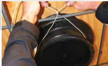
5. Attach the Infinity® wall sleeve to the rebar using wire.