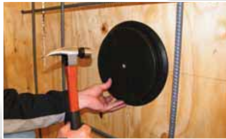
2. Screw or nail one of the locator caps at the center line.