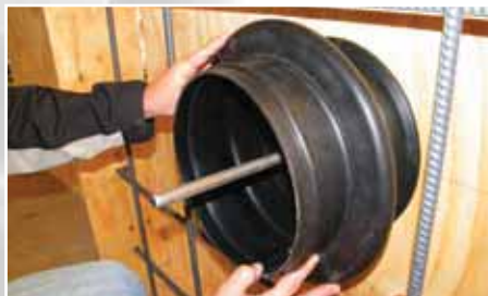
2. Attach Infinity® wall sleeve to locator cap.